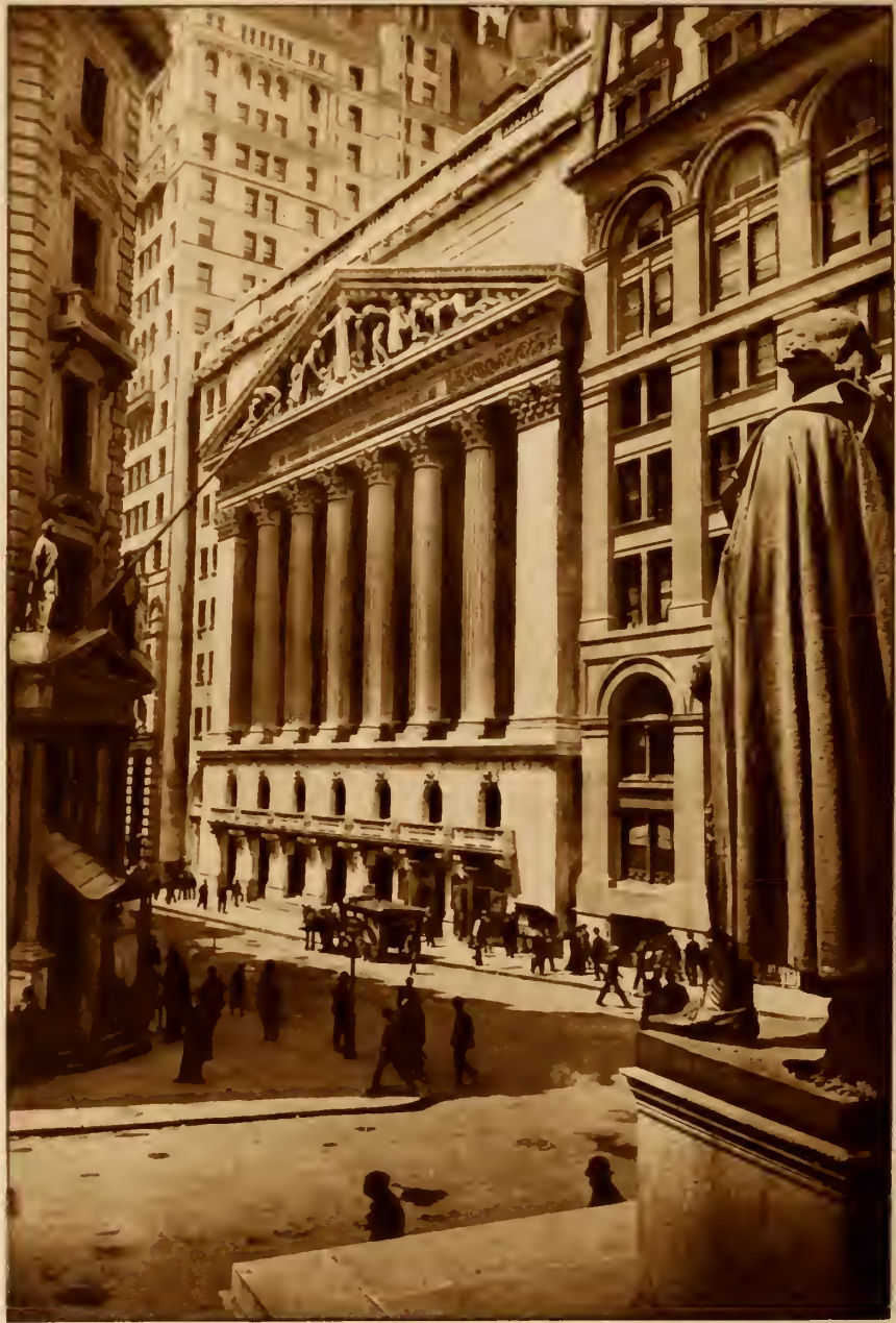
NEW YORK STOCK EXCHANGE, Broad near Wall Street. Greatest market in the world for stocks, bonds and other securities. None but members allowed on floors.